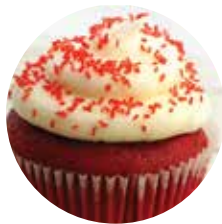
Cream Cheese Frosting