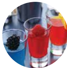
Jelly Alcohol Shots